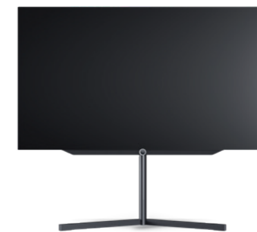
Loewe floor stand motor s.77