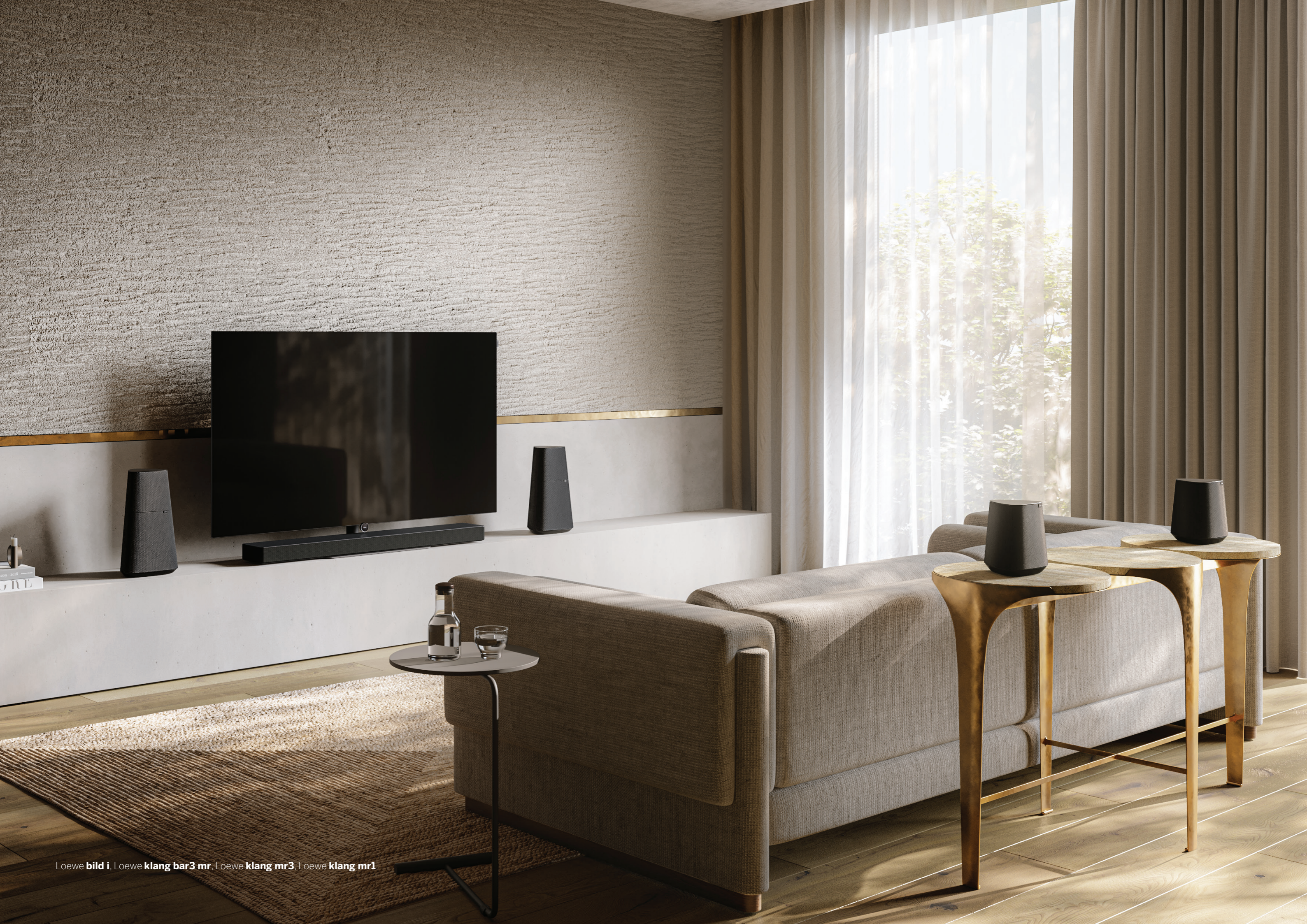
Loewe bild i, Loewe klang bar3 mr, Loewe klang mr3, Loewe klang mr1