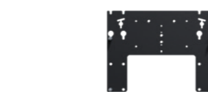
Loewe wall mount slim 432