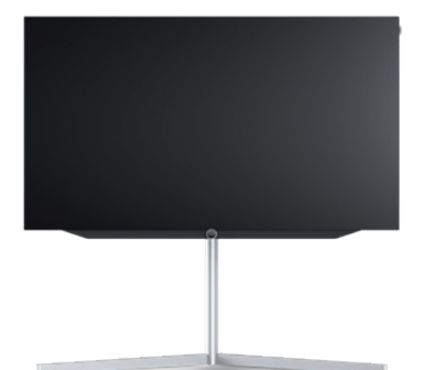
Loewe floor stand motor v