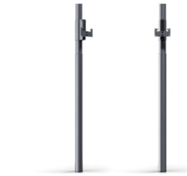
Loewe floor2ceiling stand