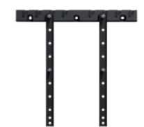
Loewe wall mount universal