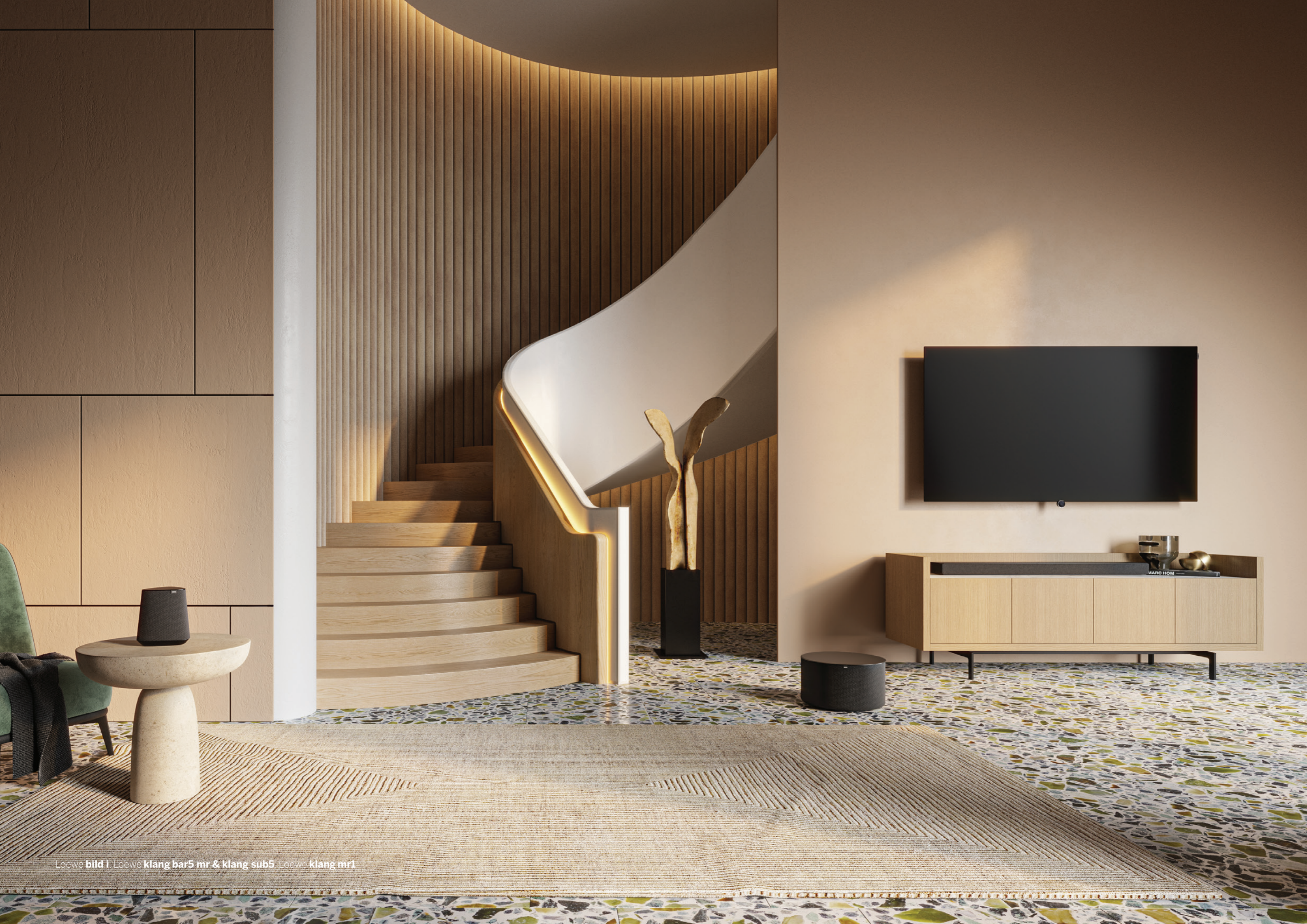
Loewe bild i Loewe klang bar5 mr & klang sub5 Loewe klang mrl