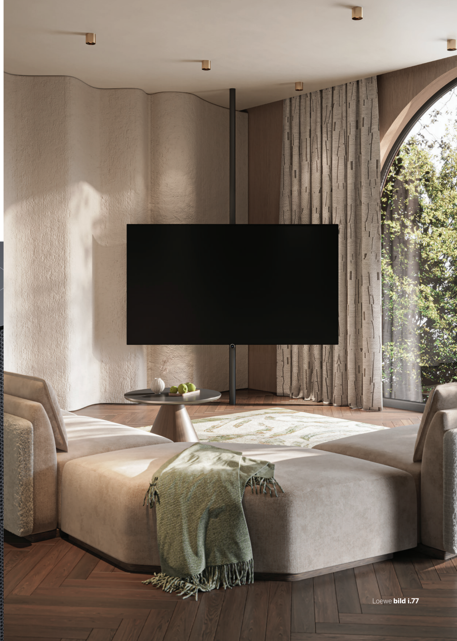
Loewe bild i.77