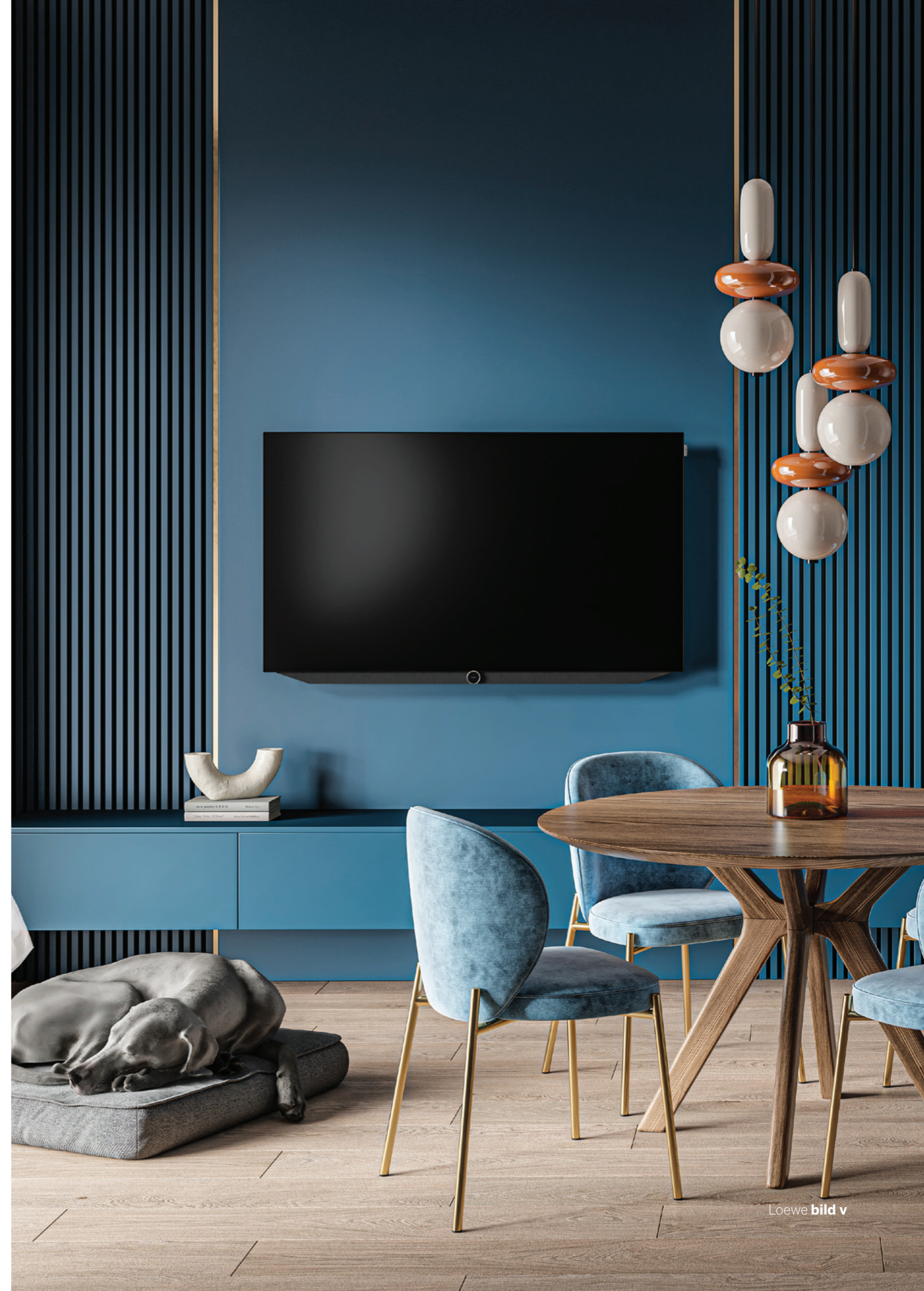
Loewe bild v