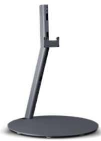
Loewe floor stand flex

Which set-up solution matches with which Loewe television can be taken from the data sheets. A glimpse of Loewe's beautiful set-up solutions can be found here: