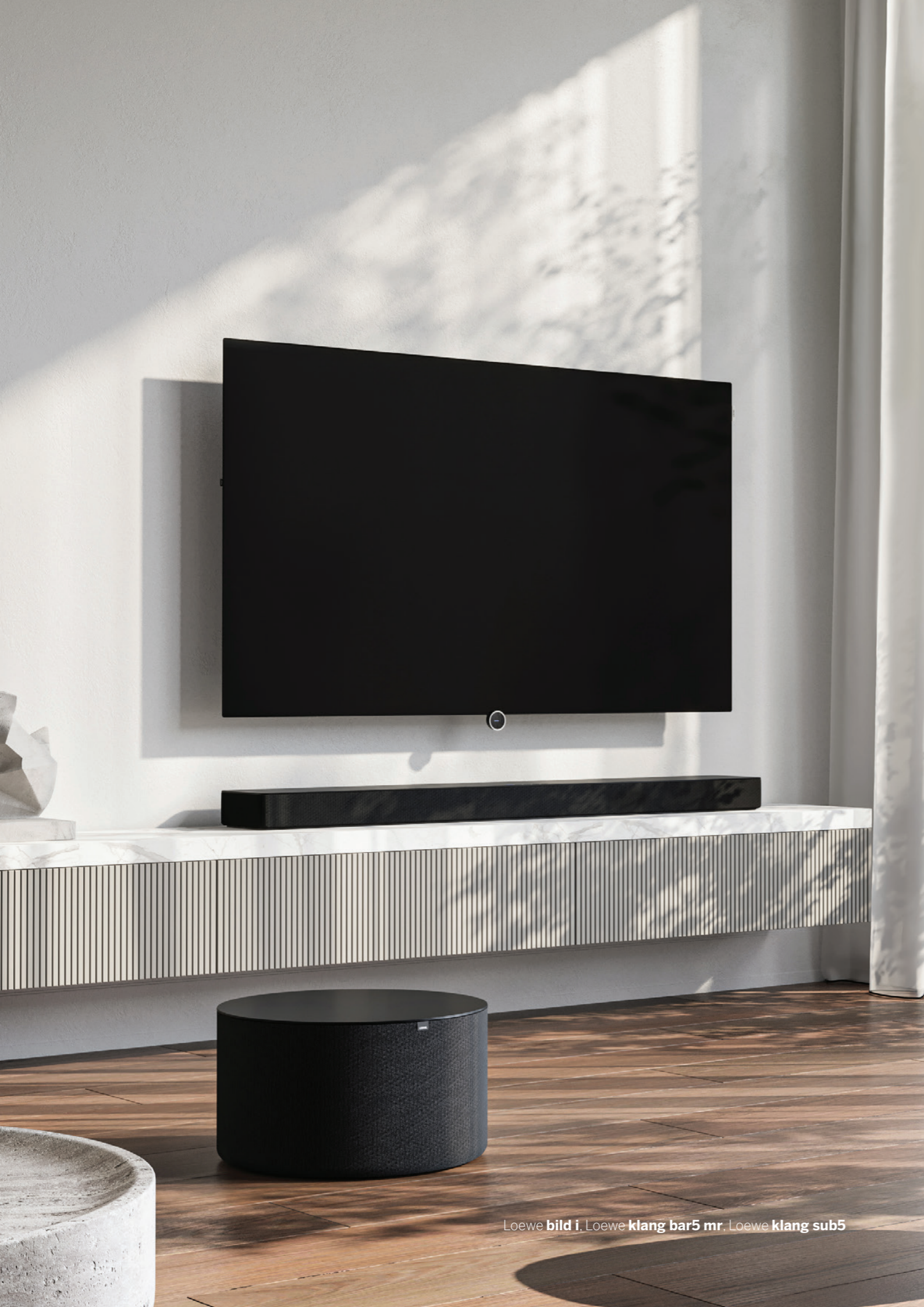
Loewe bild i, Loewe klang bar5 mr, Loewe klang sub5